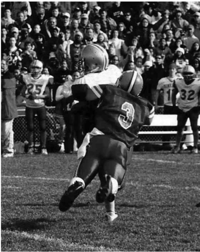
Figure 2. Initiating contact with the shoulder while keeping the head up reduces the risk of head and neck injuries.

down position and at risk of serious injury. Evidence Category: C